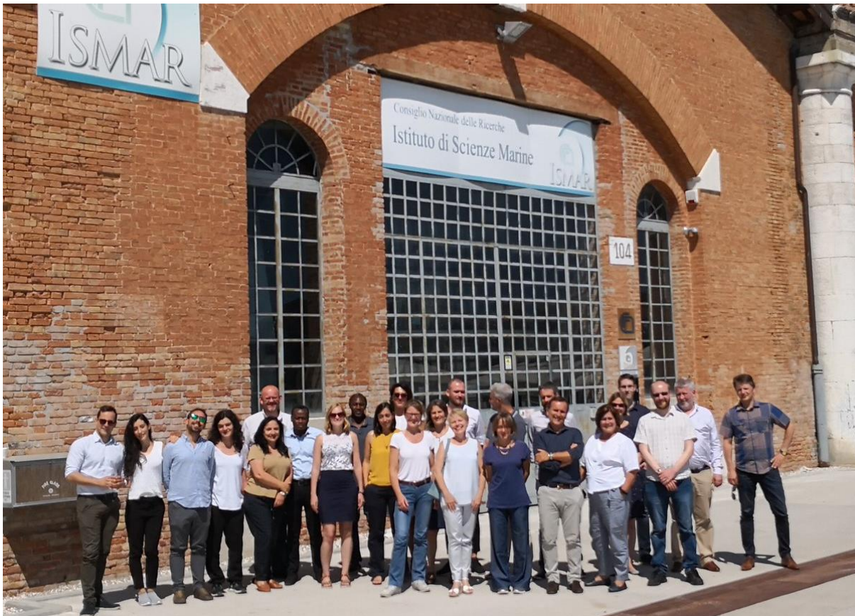
MUSES at ISMAR headquarters in Venice