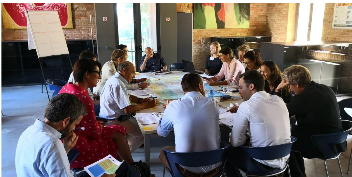
Stakeholders discuss offshore wind and fisheries multi-use at 2nd MUSES Stakeholder Workshop

The workshop report, detailing the aims, discussion and main messages of the workshop, will be uploaded to the website within the coming weeks. A brief news article, published by SUBMARINER, can also be found here .