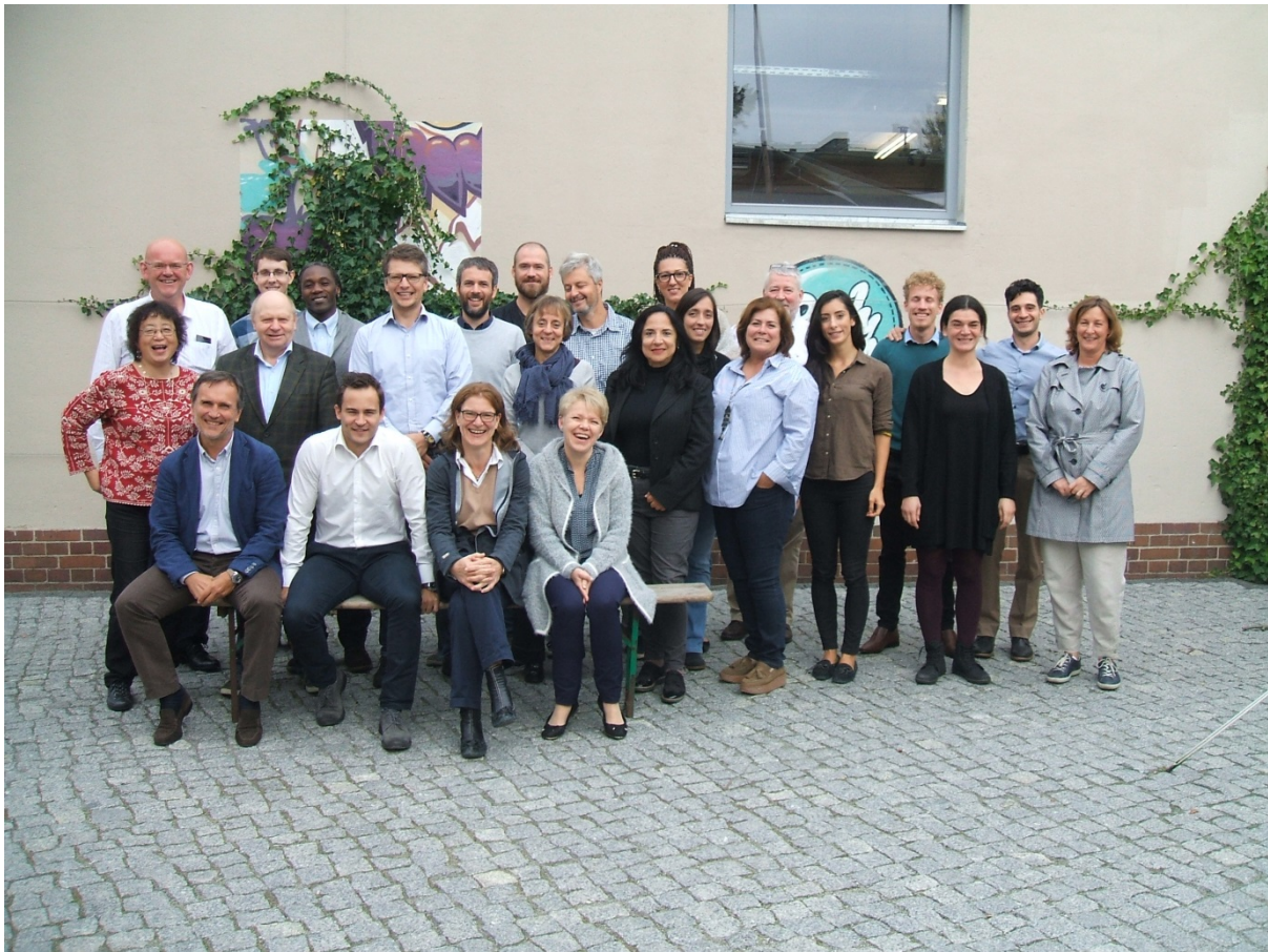
The MUSES team in Berlin!

In September MUSES held its third project steering group (PSG) meeting in Germany's capital. This time it was the turn of SUBMARINER to host the MUSES team at their offices in Berlin. During the two-day meeting there were discussions on the progress made on all of the work packages, with each partner providing a brief presentation on the work undertaken to date. The focus of the meeting was also on the deliverables that are due at the end of October & November 2017 as well as the Periodic Technical and Financial Reports.